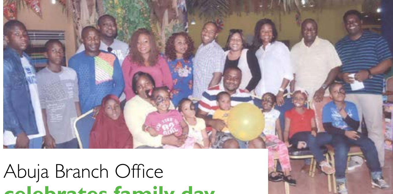
celebrates family day

"We, and indeed the African trade finance confraternity, will find this effort a very important contribution to knowledge," he added.